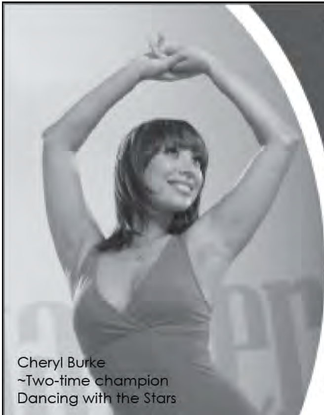
Cheryl Burke ~Two-time champion Dancing with the Stars